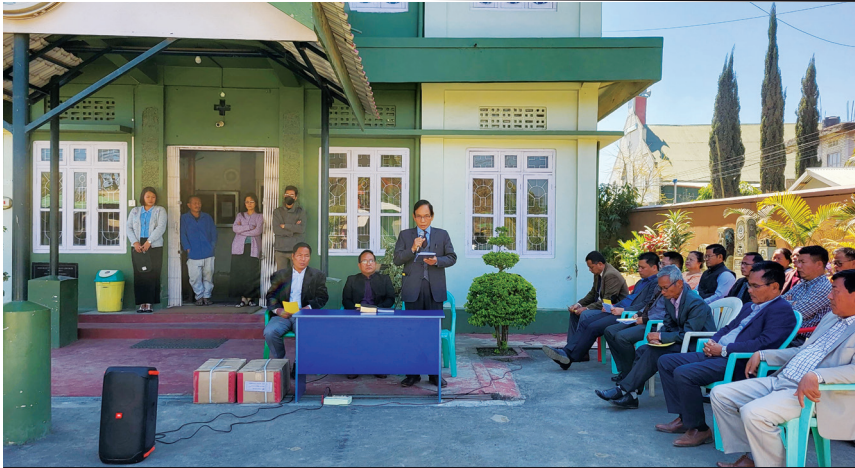
KCHRISTIAN LABU (TONIC SOLFA) LATNA PROGRAMME (7-03-2024)