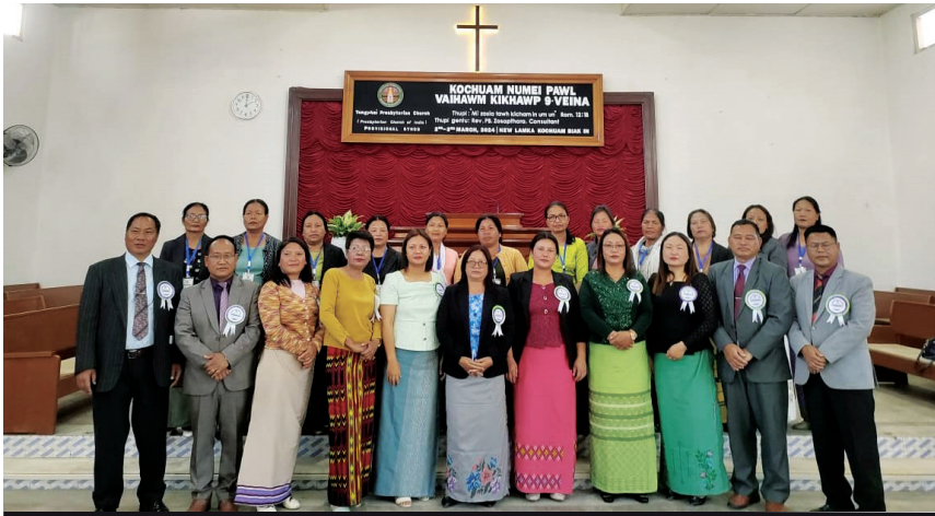
KNP VAIHAWM KIKHAWP 9-VEINA, NEW LAMKA KOCHUAM BIAK-IN