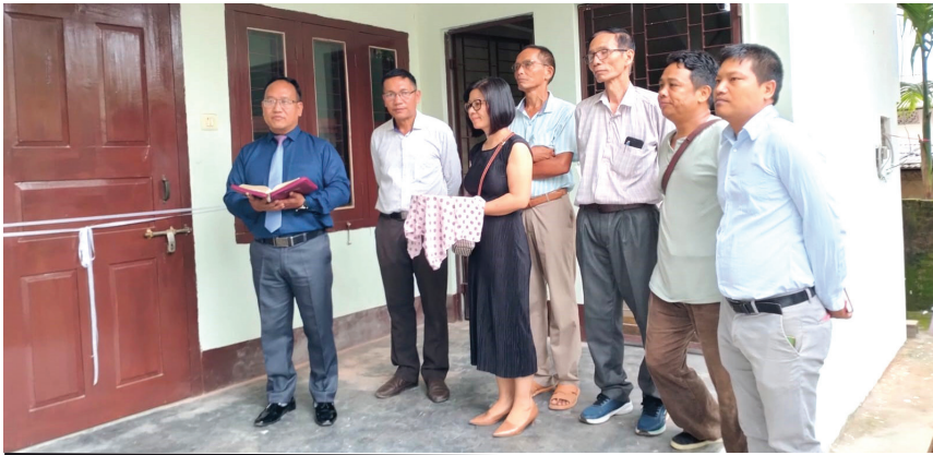
GUWAHATI PASTOR QUARTERS HAWNNA