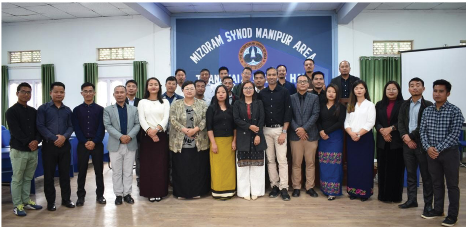
Mission Consultation (Khristian Khanglai Pawl) 17 - 03 - 2023