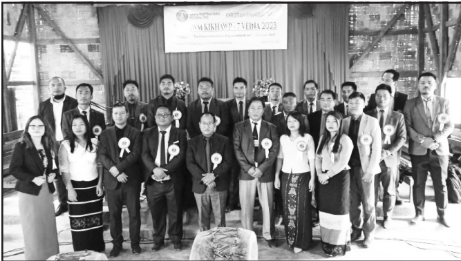
CKKP Puitu te leh lawi upa te

Khristian Khanglai Pawl te Pathian in ei umpi in ei puihuai zel ta hen!