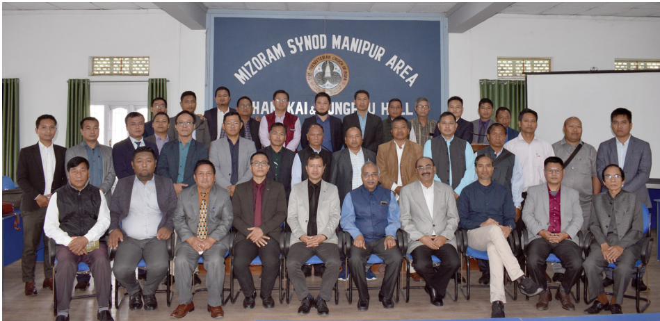
Mission Consultation (Pastor leh Pro. Pastor te) 16 - 03 - 2023