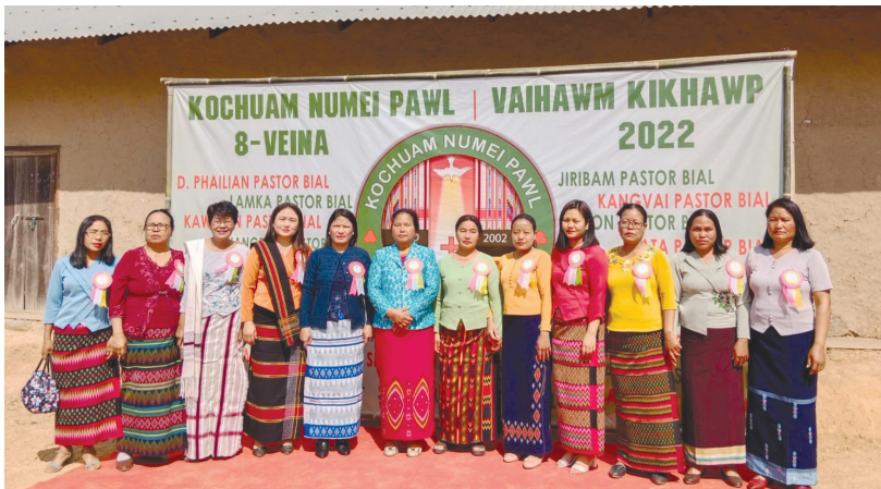
KNP Vaihawm Kikhawp 8-Veina 2022, CKNP Puitute