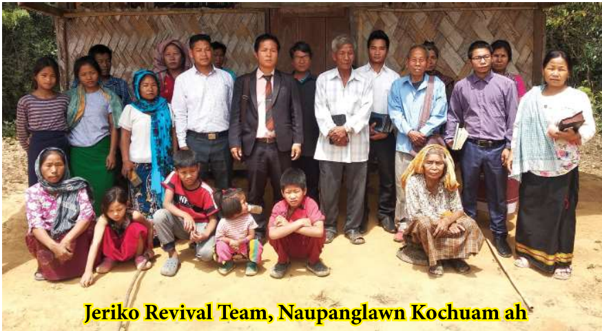
Jeriko Revival Team, Naupanglawn Kochuam ah