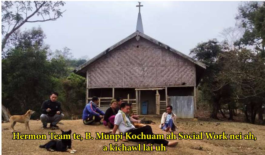
Hermon Team te, B. Munpi Kochuam ah Social Work nei ah, a kichawl lai uh